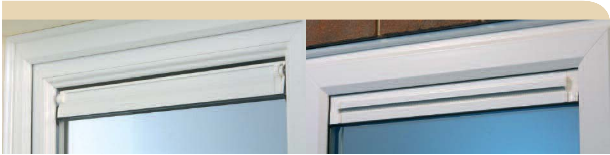
Variglaze Ventilator (inside)